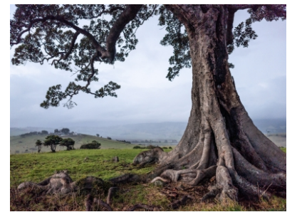
Winter Morning Acceptance Angela Gregory LAPS