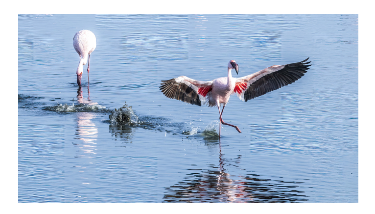
Dance of the Flamingo Merit Yvonne Hill FAPS EFIAP/b BPSA OAM