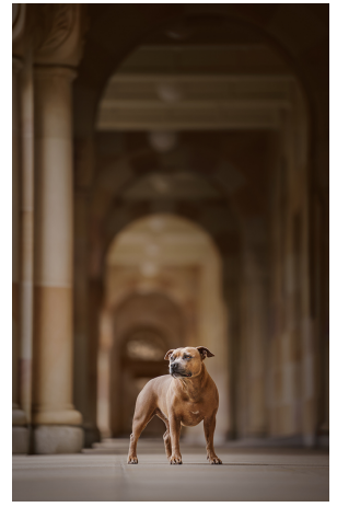
Framed Beauty Merit Zoe McGrath