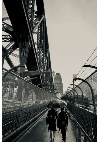
Walking in the rain Merit Geoff Newton