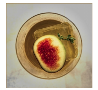
Fig Gin Acceptance Geoff Shortland