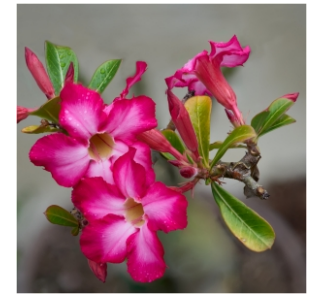
Pinks Acceptance Geoff Shortland