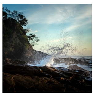
Water Tree Acceptance Jasmine Westerman