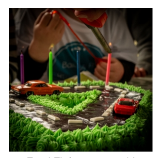
Food Fit for 4 years old Acceptance Jasmine Westerman