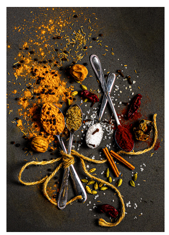
The heart of cuisine Merit Zara Azizi