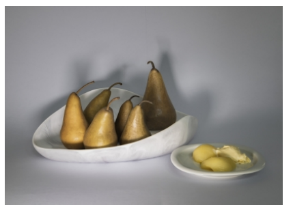
This is your future children Acceptance Roger Bartlett