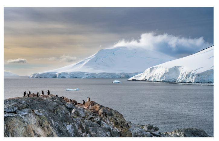
Penguins Amazing Morning View Merit Peter Moodie