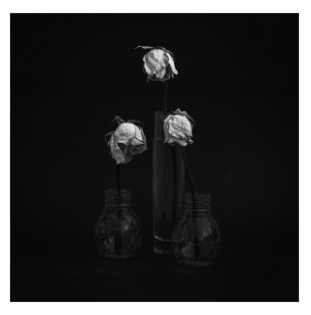
Holding your heads up even in disas Acceptance Roger Bartlett