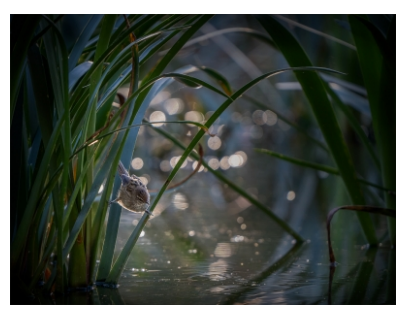
Waiting to strike Acceptance Anne Pappalardo AAPS