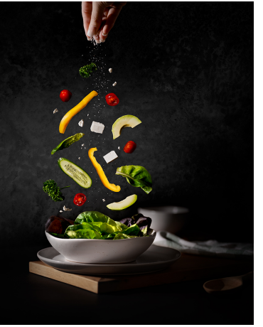
Salad Sprinkles Merit Zoe McGrath