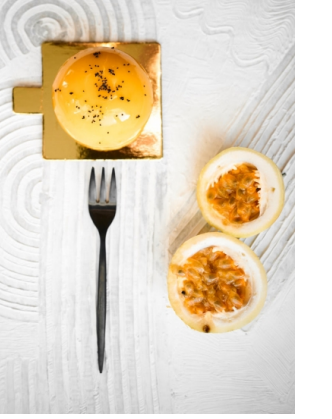
Sun-Kissed Custard Commended Mel Sinclair