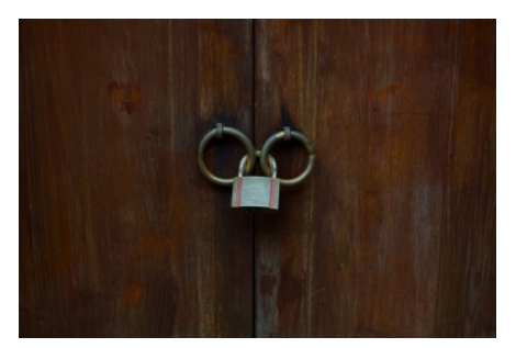
The story behind it Acceptance Chayvis Zhang